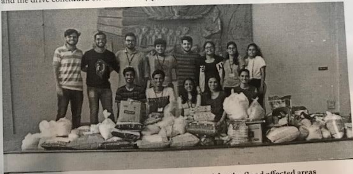
SoRT council with the food grains collected for the flood affected areas

The total donations collected at the end of the drive were 201 kg of rice, 100 kg of wheat and 58 kg of dal besides multiple boxes of biscuits which were contributed voluntarily by the students and faculty members. Everyone came together during the need of the hour as a community and the drive concluded on an extremely positive note.