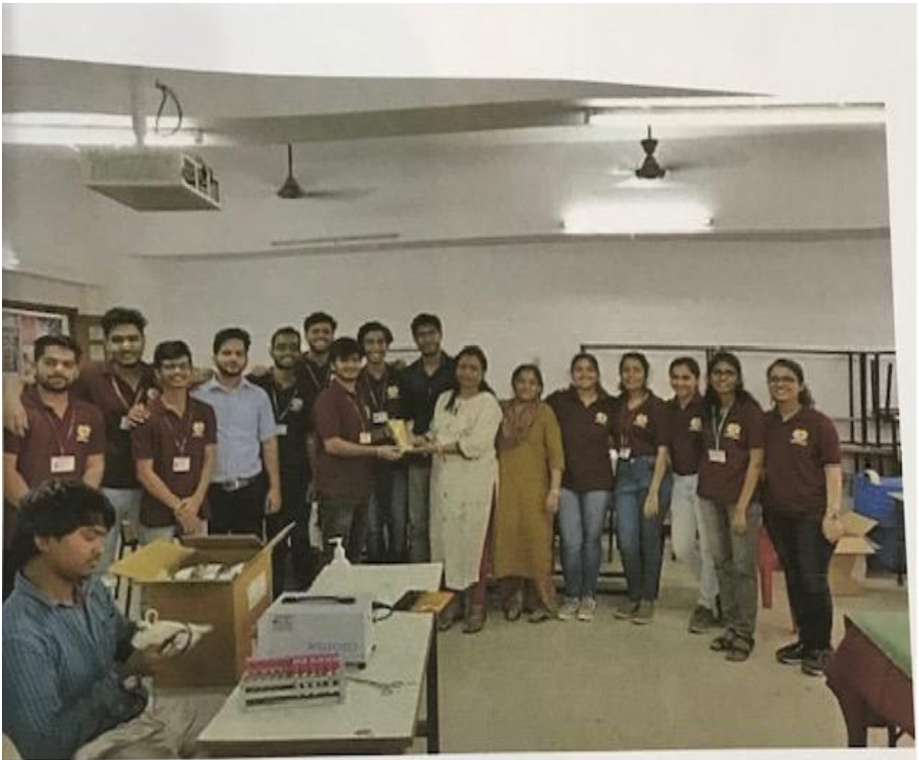
The SoRT family felicitated by the doctors for JJ Hospital and Raktapedhi.

(Affiliated to University of Mumbai, Approved by AICTE & Recognized by Govt. of Maharashtra)