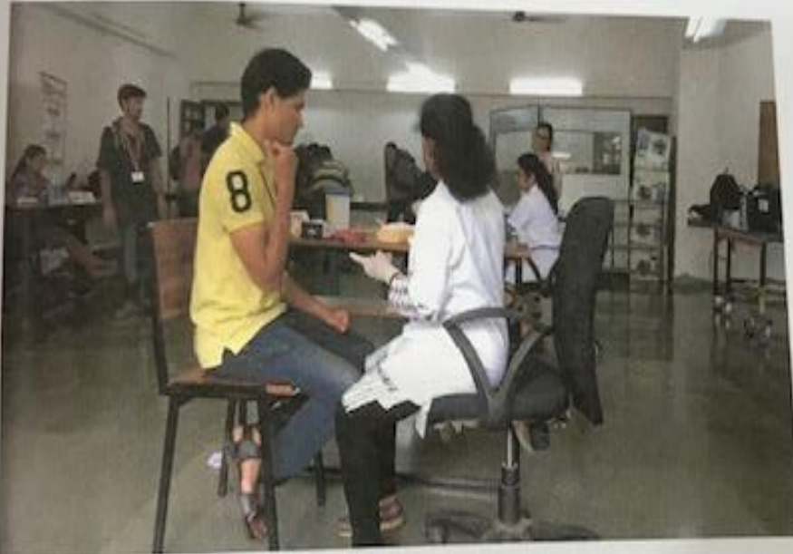
Students from VESIT register for bone marrow donation

(Affiliated to University of Mumbai, Approved by AICTE & Recognized by Govt. of Maharashtra)