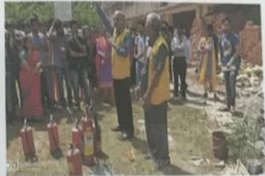
Drill Instructors explaining the procedure to use a fire extinguisher

After the session was dismissed, the instructors raised a mock alarm at a stipulated time, of which only the members in the auditorium were informed. Minutes after the mock alarm, the entire college was evacuated in a organized manner with the council members managing their safe exit. One of the students was kept in an undisclosed location in the college to test the search and rescue teams efficiency. The fire extinguisher team were instructed to collect all the fire extinguishers from the college. Later, they gave us a hands-on demonstration to the use of the extinguishers and how to efficiently tackle fires.